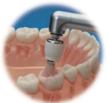
Tooth surface cleaning and polishing in the occlusal area (e.g. with snap-on system)