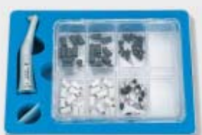
Prophy Axis contra-angle with YOUNG range of cups and brushes. WP-64 M or WP-68 M