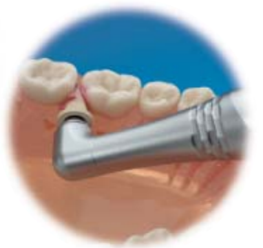
Tooth surface cleaning and polishing in the interdental area (e.g. with snap-on system)