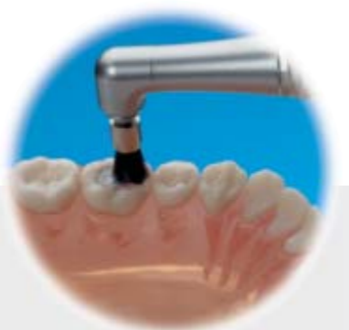
Amalgam filling polishing in the occlusal area (e.g. with screw-in system)