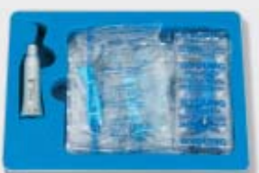
Prophy Axis straight handpiece with YOUNG-range of disposable contra-angles. HP-44 M

W&H Dentalwerk Bürmoos GmbH Ignaz-Glaser-Straße 53, Postfach 1 5111 Bürmoos, Austria