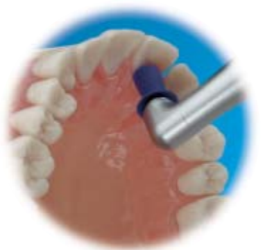
Composite filling polishing in the anterior area (e.g. with screw-in system)